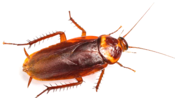
American cockroach ( Periplaneta americana )

In the Philippines, there are 2 cockroach species that cause cockroach allergy, namely: