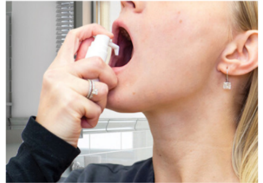
Sublingual immunotherapy (SLIT)