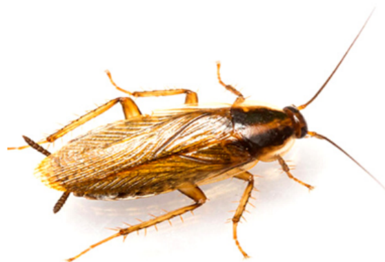
German cockroach ( Blattella germanica )