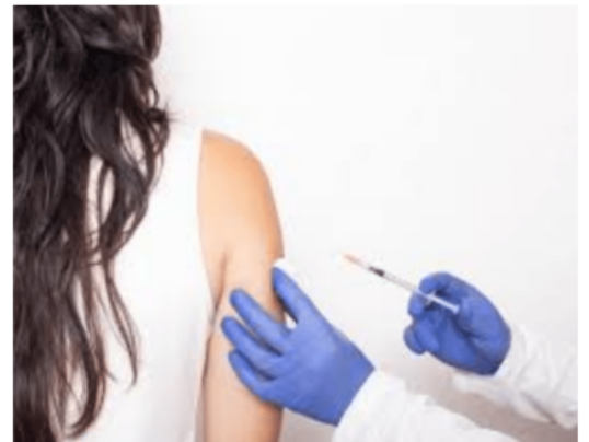
Subcutaneous immunotherapy (SCIT)